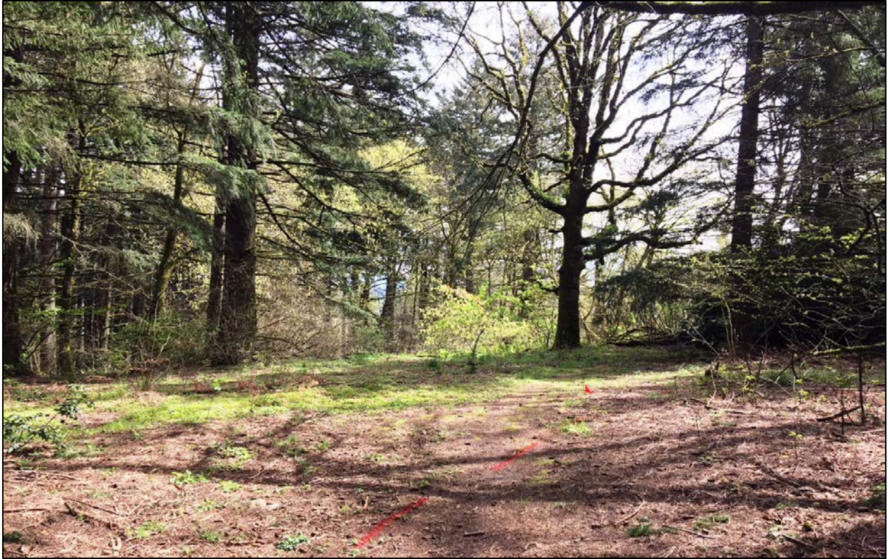
Figure 3. View of proposed lease area facing southeast.