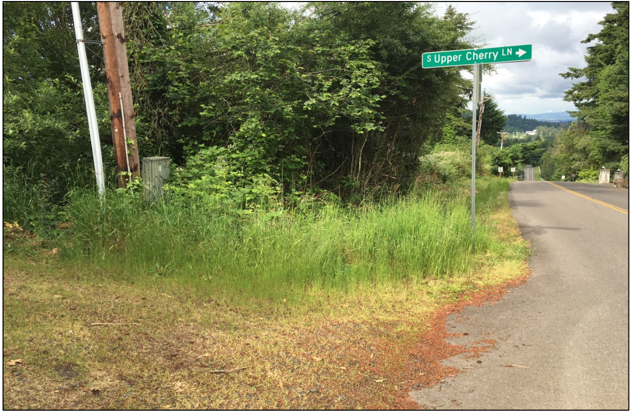
Figure 5. View facing north of the proposed access/utility corridor.