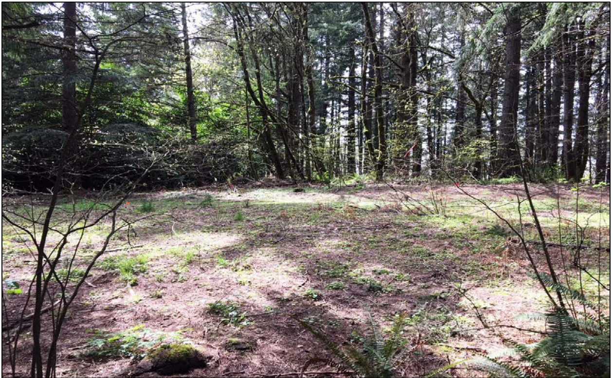
Figure 4. View facing east of proposed lease area facing west.