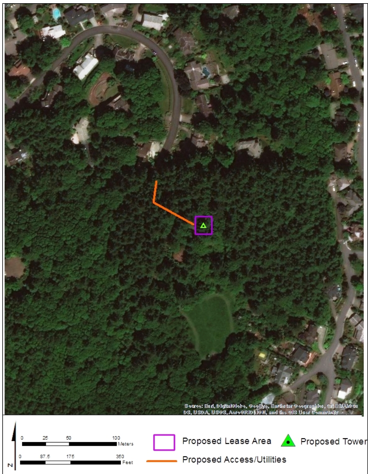
Figure 2. Aerial map of proposed lease area with proposed construction elements.